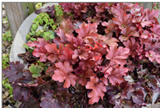
Peach Flambe Coral Bells

Peach Flambe Coral Bells is a fine choice for the garden, but it is also a good selection for planting in outdoor pots and containers. It is often used as a 'filler' in the 'spiller-thriller-filler' container combination, providing a mass of flowers and foliage against which the larger thriller plants stand out. Note that when growing plants in outdoor containers and baskets, they may require more frequent waterings than they would in the yard or garden.