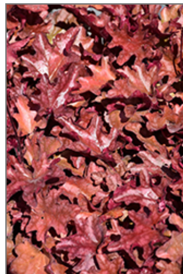
Peach Flambe Coral Bells foliage

Peach Flambe Coral Bells is recommended for the following landscape applications;