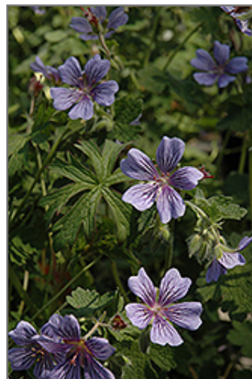
Brookside Cranesbill flowers

Brookside Cranesbill is recommended for the following landscape applications;