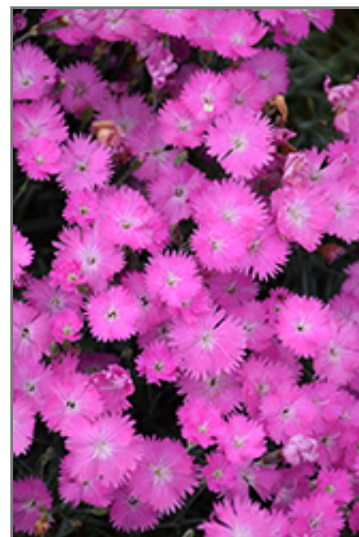
Firewitch Pinks flowers

Firewitch Pinks is recommended for the following landscape applications;