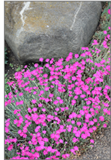
Firewitch Pinks in bloom

Firewitch Pinks is a fine choice for the garden, but it is also a good selection for planting in outdoor pots and containers. It is often used as a 'filler' in the 'spiller-thriller-filler' container combination, providing a mass of flowers and foliage against which the thriller plants stand out. Note that when growing plants in outdoor containers and baskets, they may require more frequent waterings than they would in the yard or garden.