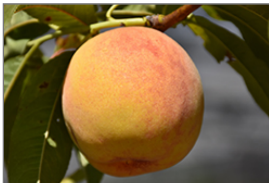
Reliance Peach fruit

Reliance Peach is clothed in stunning clusters of fragrant pink flowers along the branches in early spring, which emerge from distinctive rose flower buds before the leaves. It has dark green deciduous foliage. The narrow leaves turn yellow in fall. The fruits are showy yellow drupes with a red blush, which are carried in abundance in mid summer. The fruit can be messy if allowed to drop on the lawn or walkways, and may require occasional clean-up.