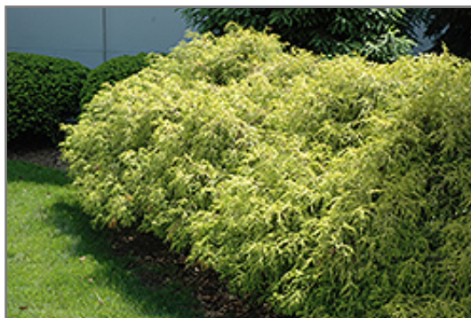
Dwarf Golden Sawara Falsecypress