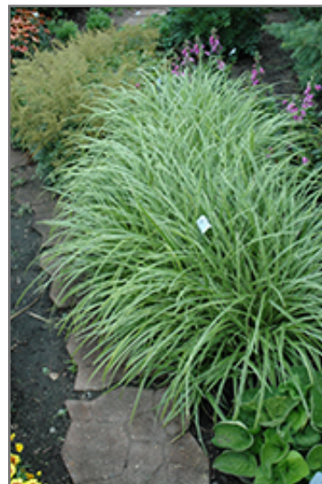
Ice Dance Sedge