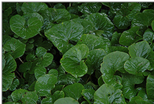
Canadian Wild Ginger