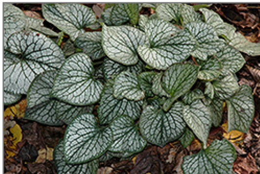
Jack Frost Bugloss foliage

Jack Frost Bugloss is recommended for the following landscape applications;