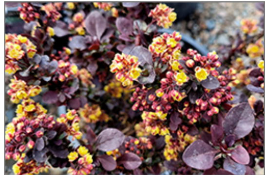
Concorde Japanese Barberry flowers

Concorde Japanese Barberry will grow to be about 18 inches tall at maturity, with a spread of 24 inches. It tends to fill out right to the ground and therefore doesn't necessarily require facer plants in front. It grows at a slow rate, and under ideal conditions can be expected to live for approximately 20 years.