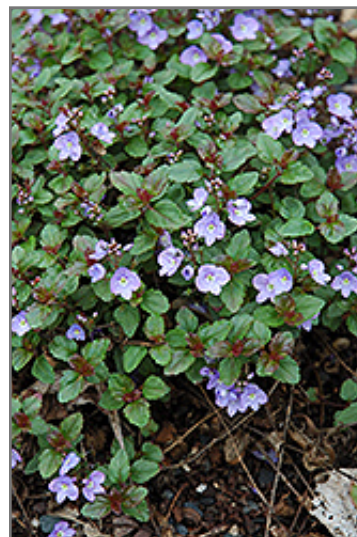
Waterperry Blue Speedwell in bloom