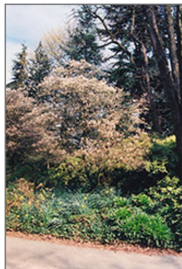
European Serviceberry in bloom