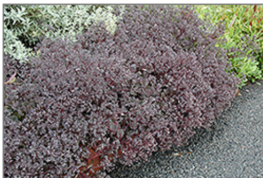
Bertram Anderson Stonecrop