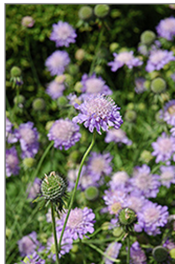
Blue Mist Pincushion Flower flowers