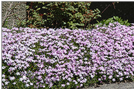
Emerald Blue Moss Phlox in bloom

This plant does best in full sun to partial shade. It prefers dry to average moisture levels with very well-drained soil, and will often die in standing water. It is considered to be drought-tolerant, and thus makes an ideal choice for a low-water garden or xeriscape application. It is not particular as to soil type, but has a definite preference for alkaline soils. It is highly tolerant of urban pollution and will even thrive in inner city environments. Consider covering it with a thick layer of mulch in winter to protect it in exposed locations or colder microclimates. This is a selection of a native North American species. It can be propagated by division; however, as a cultivated variety, be aware that it may be subject to certain restrictions or prohibitions on propagation.