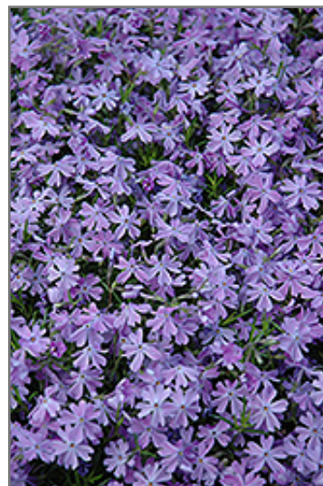
Emerald Blue Moss Phlox flowers