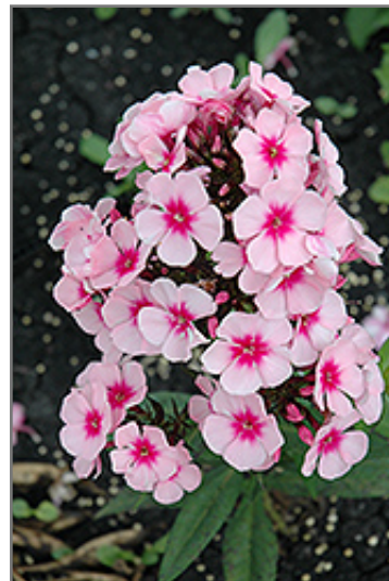
Bright Eyes Garden Phlox flowers

Bright Eyes Garden Phlox is a fine choice for the garden, but it is also a good selection for planting in outdoor pots and containers. With its upright habit of growth, it is best suited for use as a 'thriller' in the 'spiller-thriller-filler' container combination; plant it near the center of the pot, surrounded by smaller plants and those that spill over the edges. It is even sizeable enough that it can be grown alone in a suitable container. Note that when growing plants in outdoor containers and baskets, they may require more frequent waterings than they would in the yard or garden.