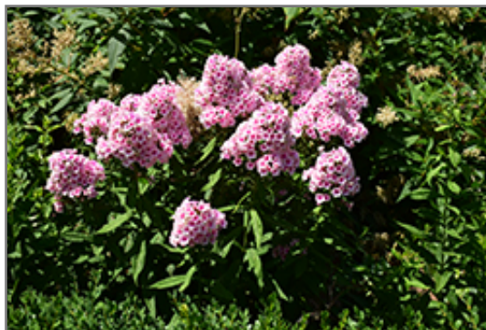
Bright Eyes Garden Phlox in bloom