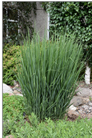
Northwind Switch Grass

Northwind Switch Grass will grow to be about 4 feet tall at maturity, with a spread of 3 feet. It tends to be leggy, with a typical clearance of 1 foot from the ground, and should be underplanted with lower-growing perennials. It grows at a medium rate, and under ideal conditions can be expected to live for approximately 15 years. As an herbaceous perennial, this plant will usually die back to the crown each winter, and will regrow from the base each spring. Be careful not to disturb the crown in late winter when it may not be readily seen!