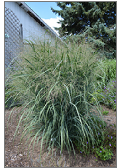
Northwind Switch Grass in bloom

This plant does best in full sun to partial shade. It is very adaptable to both dry and moist locations, and should do just fine under typical garden conditions. It is considered to be drought-tolerant, and thus makes an ideal choice for a low-water garden or xeriscape application. It is not particular as to soil type, but has a definite preference for alkaline soils, and is able to handle environmental salt. It is somewhat tolerant of urban pollution. This is a selection of a native North American species. It can be propagated by division; however, as a cultivated variety, be aware that it may be subject to certain restrictions or prohibitions on propagation.