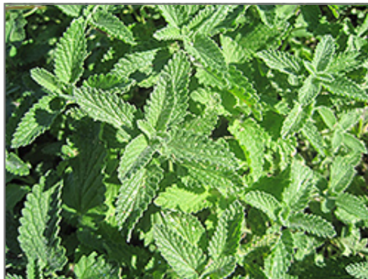
Walker's Low Catmint foliage

Walker's Low Catmint is a fine choice for the garden, but it is also a good selection for planting in outdoor pots and containers. It is often used as a 'filler' in the 'spiller-thriller-filler' container combination, providing a mass of flowers against which the thriller plants stand out. Note that when growing plants in outdoor containers and baskets, they may require more frequent waterings than they would in the yard or garden.