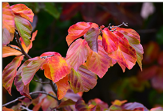
Persian Parrotia in fall