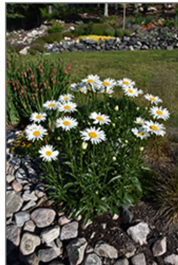
Becky Shasta Daisy in bloom

Becky Shasta Daisy is a fine choice for the garden, but it is also a good selection for planting in outdoor pots and containers. Because of its height, it is often used as a 'thriller' in the 'spiller-thriller-filler' container combination; plant it near the center of the pot, surrounded by smaller plants and those that spill over the edges. It is even sizeable enough that it can be grown alone in a suitable container. Note that when growing plants in outdoor containers and baskets, they may require more frequent waterings than they would in the yard or garden.