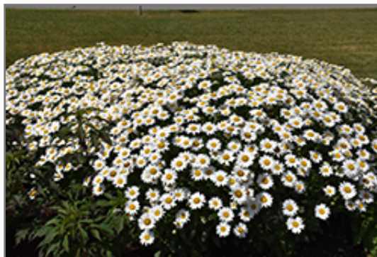
Becky Shasta Daisy in bloom