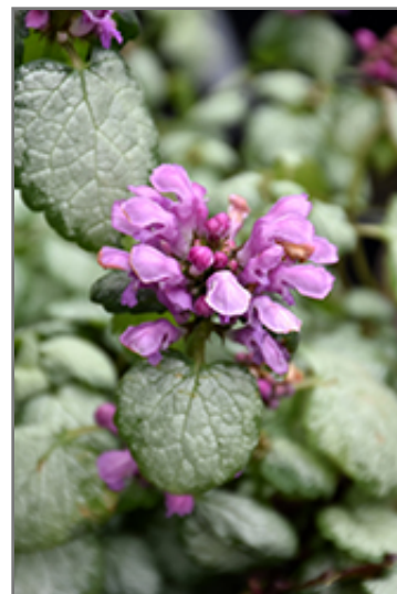
Red Nancy Spotted Dead Nettle flowers