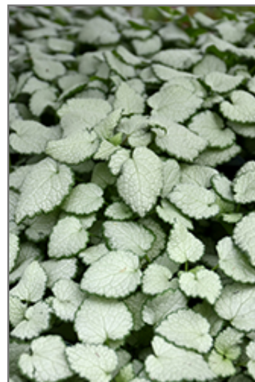
Red Nancy Spotted Dead Nettle foliage

Red Nancy Spotted Dead Nettle is a fine choice for the garden, but it is also a good selection for planting in outdoor pots and containers. Because of its spreading habit of growth, it is ideally suited for use as a 'spiller' in the 'spiller-thriller-filler' container combination; plant it near the edges where it can spill gracefully over the pot. Note that when growing plants in outdoor containers and baskets, they may require more frequent waterings than they would in the yard or garden.