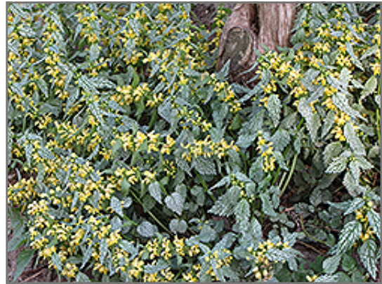
Hermann's Pride Yellow Archangel in bloom

This plant does best in partial shade to shade. It is an amazingly adaptable plant, tolerating both dry conditions and even some standing water. It is considered to be drought-tolerant, and thus makes an ideal choice for a low-water garden or xeriscape application. It is not particular as to soil type or pH. It is highly tolerant of urban pollution and will even thrive in inner city environments. This is a selected variety of a species not originally from North America. It can be propagated by division; however, as a cultivated variety, be aware that it may be subject to certain restrictions or prohibitions on propagation.