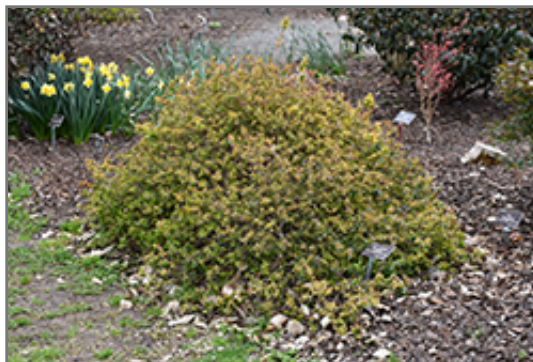
Gold Dust Abelia