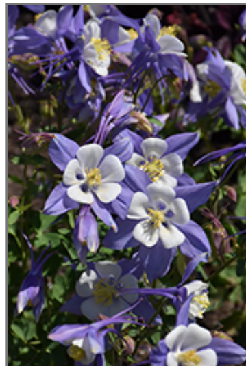
Songbird Blue Jay Columbine flowers