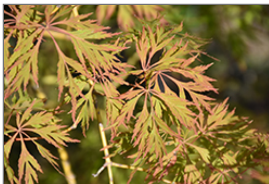
Ice Dragon Maple foliage