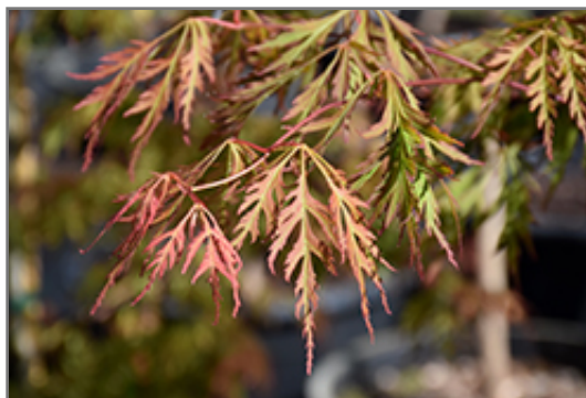
Ice Dragon Maple foliage

Ice Dragon Maple is recommended for the following landscape applications;