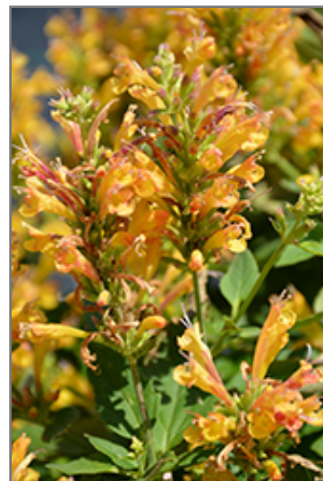
Poquito Butter Yellow Hyssop flowers