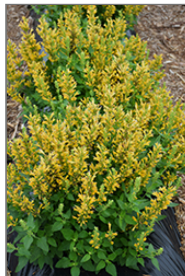
Poquito Butter Yellow Hyssop in bloom