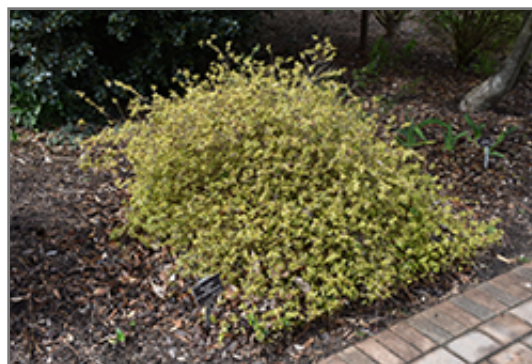
Twist of Orange Glossy Abelia