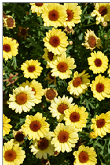
Grandessa Yellow Marguerite Daisy flowers