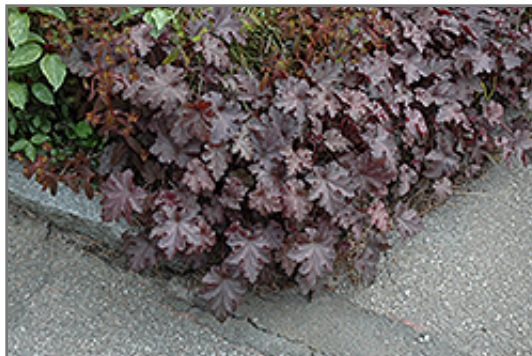
Stormy Seas Coral Bells

Stormy Seas Coral Bells is recommended for the following landscape applications;