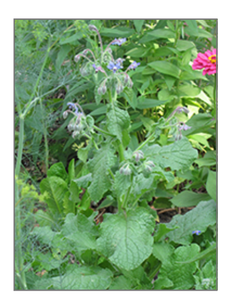
Borage in bloom

This plant is quite ornamental as well as edible, and is as much at home in a landscape or flower garden as it is in a designated herb garden. It does best in full sun to partial shade. It prefers dry to average moisture levels with very well-drained soil, and will often die in standing water. It is not particular as to soil type or pH. It is somewhat tolerant of urban pollution. This species is not originally from North America..