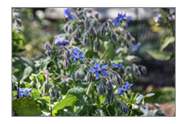
Borage flowers

Borage will grow to be about 3 feet tall at maturity, with a spread of 18 inches. When grown in masses or used as a bedding plant, individual plants should be spaced approximately 18 inches apart. This fast-growing annual will normally live for one full growing season, needing replacement the following year.