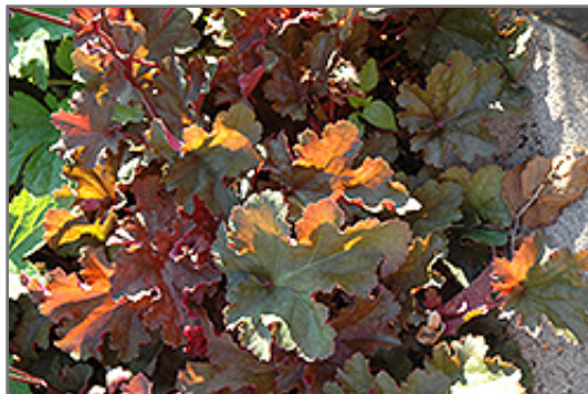
Chocolate Ruffles Coral Bells foliage

Chocolate Ruffles Coral Bells will grow to be about 10 inches tall at maturity extending to 24 inches tall with the flowers, with a spread of 12 inches. When grown in masses or used as a bedding plant, individual plants should be spaced approximately 10 inches apart. Its foliage tends to remain low and dense right to the ground. It grows at a medium rate, and under ideal conditions can be expected to live for approximately 10 years. As an evergreen perennial, this plant will typically keep its form and foliage year-round.