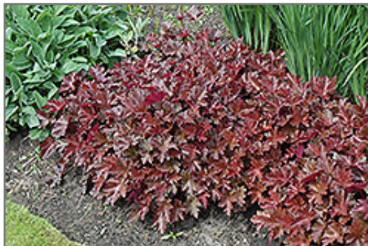
Chocolate Ruffles Coral Bells

Chocolate Ruffles Coral Bells is recommended for the following landscape applications;