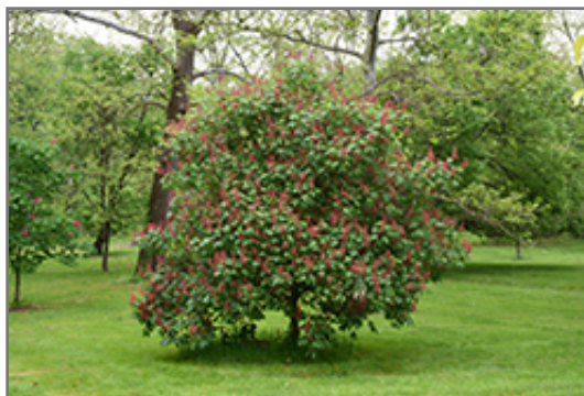
Splendens Red Buckeye in bloom