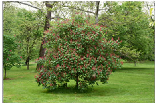
Splendens Red Buckeye in bloom