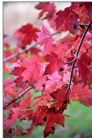
Redpointe Red Maple (clump) in fall