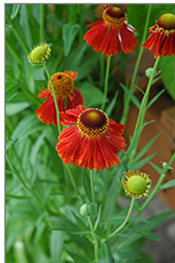
Moerheim Beauty Sneezeweed flowers

Moerheim Beauty Sneezeweed is recommended for the following landscape applications;