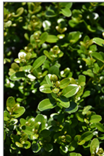
Sprinter Boxwood foliage