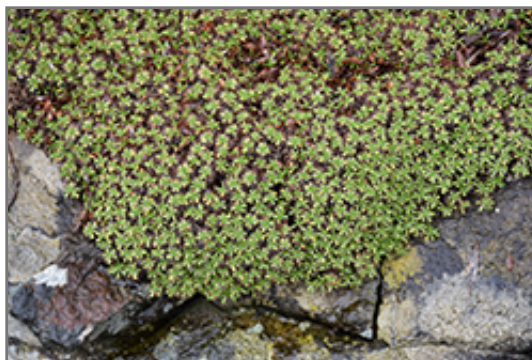
Cushion Bolax