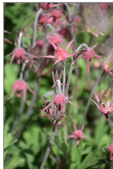
Prairie Smoke flower buds