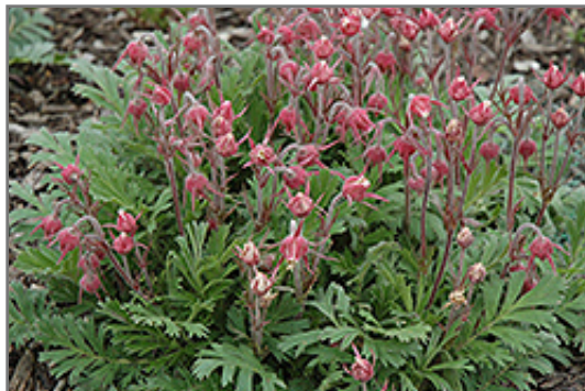
Prairie Smoke in bloom