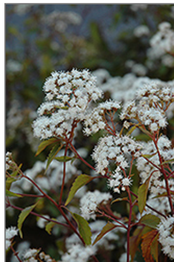
Chocolate Boneset flowers