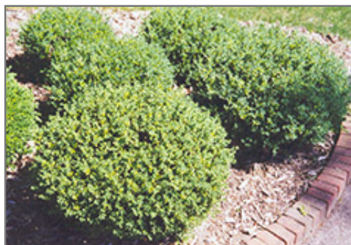
Japanese Boxwood