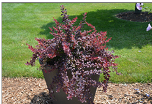
Sunjoy Syrah Japanese Barberry in bloom