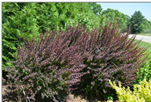
Sunjoy Syrah Japanese Barberry