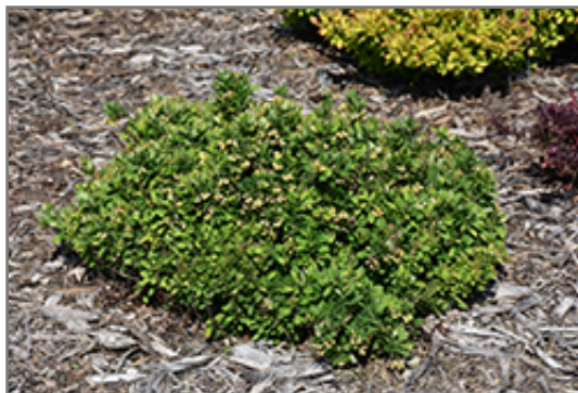
Moscato Barberry