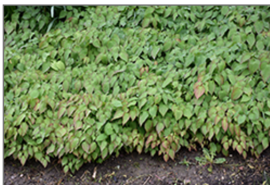
Bishop's Hat