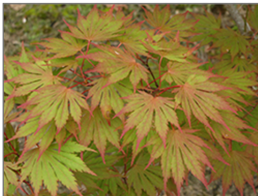
Sensu Full Moon Maple foliage