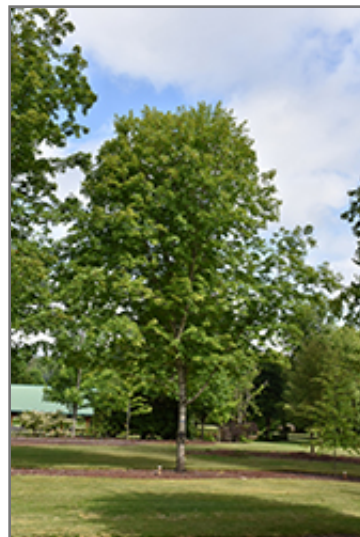
John Pair Sugar Maple