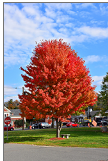
Autumn Splendor Sugar Maple in fall