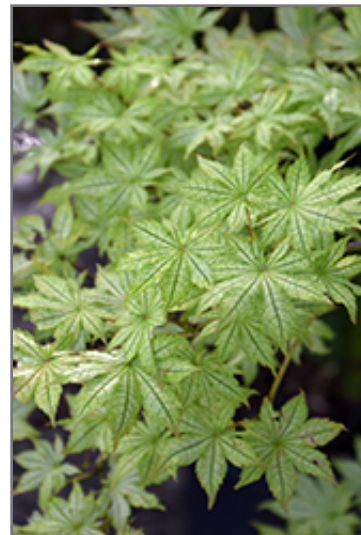
Shigitatsu Sawa Japanese Maple foliage