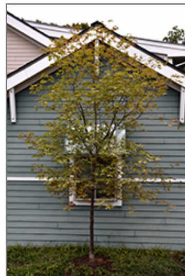
Cinnamon Girl Paperbark Maple in fall