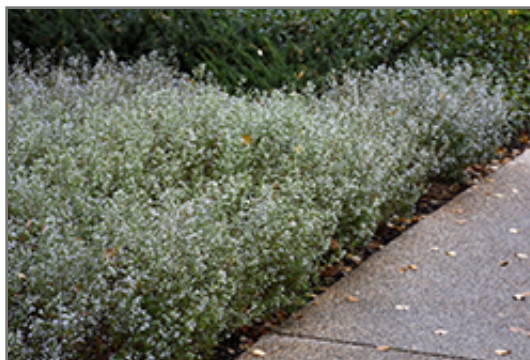
Dwarf Calamint in bloom

Dwarf Calamint is recommended for the following landscape applications;