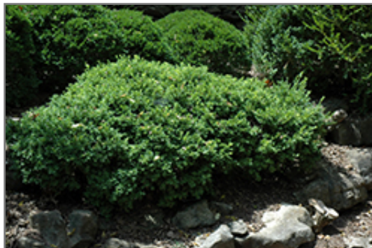
Grace Hendrick Phillips Boxwood