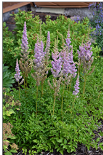
Dwarf Chinese Astilbe in bloom