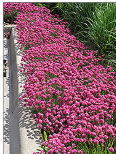
Dusseldorf Pride Sea Thrift in bloom

Dusseldorf Pride Sea Thrift is recommended for the following landscape applications;