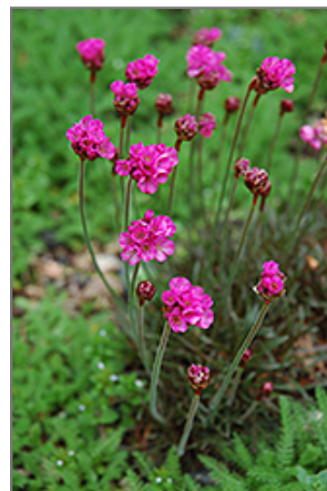
Dusseldorf Pride Sea Thrift flowers